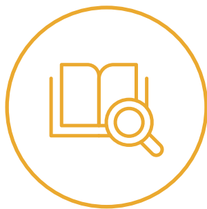
Build on previous research

We invite you to share research ideas to help fuel global Bible engagement, as well. Contact research@odb.org for more information.