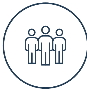
Research-based discipleship journeys